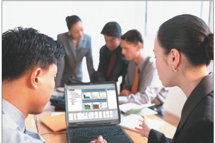
With WebSphere Information Integrator, Taikang business executives can easily access and better manage statistical data to facilitate superior business decision making.

Lower IT costs; faster development of new applications; comprehensive status reports delivered to corporate executives in real time, leading to improved strategic decision making and business analysis; increased employee productivity; enhanced customer service and business development opportunities