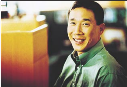
Taikang's flexible computing environment quickly adapts to the changing demands of its user community.

The fact that the business unit applications were developed using different tools further complicated the environment. In addition, customer information is stored in a wide variety of formats, ranging from faxes and e-mails sent to Taikang's call center, which are then translated into XML, to incoming updates from the company's Web site that arrive in structured query language format.